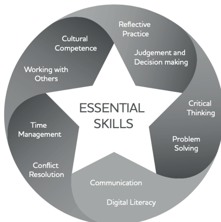
Figure 2: Essential skills diagram (Embedding Employability Working Group)

situation, task, action and result when addressing these skills in written reflections. The STAR model is recommended to students by the West Australian Health Department graduate recruitment system when applying for a graduate position.