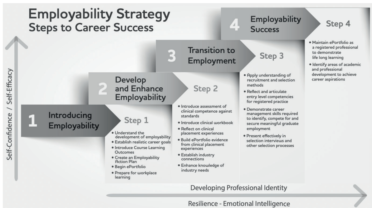
Figure 1: Employability strategy diagram (Embedding Employability Working Group)

A school employability strategy was developed using a "steps" analogy to convey to students the staged approach to developing employment skills. The strategy diagram (Figure 1) illustrates the specific points in the course where these skills are addressed and the skills that are developed across the entire strategy. The steps of the strategy illustrate the stages of introduction of employability, the development and enhancement of employability skills and the transition stage to and beyond employment. The end goal of employability success identifies lifelong learning and continued professional development to achieve career aspirations.